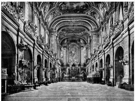
Fig. 03 - Napoli, internal view of the Santa Chiara's church before the Allied bombing of 1943, photographic archive of the Superintendence for Architectural Heritage for Naples and its province (ASBAN).

which all the surviving Baroque layers will be removed in accordance with a method adopted by several superintendents in the South (Figg. 3-5). In the report following the preliminary investigation of the damage suffered by Teano city, marked by considerable loss to the religious structures as a result of military operations, Captain F.H.J. Maxse highlights the need to recover the capitals "debarochise them", stressing not only the damage's substance but also the direction of a possible future intervention. This attitude is again clear when considering the Subcommission made up of leading figures by the world of American culture, often formed through the study of the Italian artistic heritage.