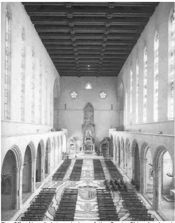
Fig. 05 - Napoli, internal view of the Santa Chiara's church after restoration work.