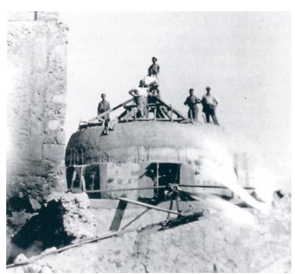
Fig. 02 - San Pietro Infine (CE), the post-war reconstruction of the dome of San Michele Arcangelo with the use of reinforced concrete (Zambardi 2003)

through the reconstruction sites. Exemplifying is the case of the church's dome of San Michele Arcangelo in San Pietro Infine, collapsed shortly after its creation (Spinosa, Vitagliano, 2008) (Fig. 2).