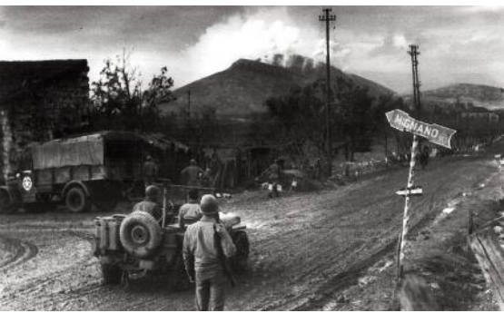
Fig 06 Mignano Monte Lungo (CE), the arrival of the New Zealand troops before the filming that simulates the battle (Angelone 2011).

By several cases investigated emerges the awareness that reconstruction actions, realized mostly by Genio Civile, do not follow criteria always consistent: if for architecture differs according to the damage suffered, for historic towns urban accommodations sometimes arise from need to resolve problems, such as roads, and to improve the living conditions of the people, rather than to implement reconstruction plans. All that happened neglecting what was the meaning of these towns, especially those partially destroyed.