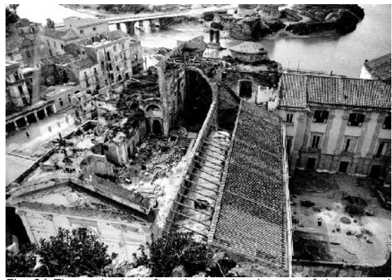
Fig. 01 The cathedral after the bombardments of the second world war

following the Allied landing at Salerno and the overcoming of the Gustav line in May 1944, the continuous bombing will produce heavy losses to the architectural heritage with destruction both in historical centers, such as Capua, and in major monuments such as the Sant'Angelo in Formis's Basilica (Fig. 1). The emerging view highlights some problematic issues, whose investigation is of interest for understanding the logic that implies the phase immediately following the war, relating to the first post-war reconstruction.