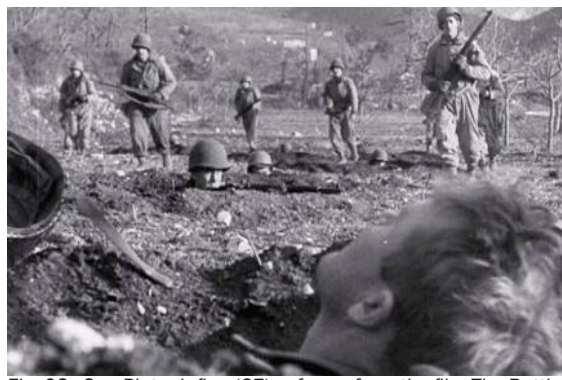
Fig. 08 - San Pietro Infine (CE), a frame from the film The Battle of San Pietro by director John Huston.