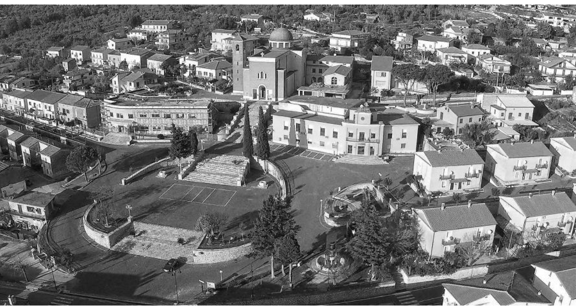
Fig 12 - San Pietro Infine (CE), the new city, built on another site between 1945 and 1950.

during demolition operations by order of the allied officers (Figg. 8-11). The bell tower of the Sant'Anthonio da Padova's church is among of these.