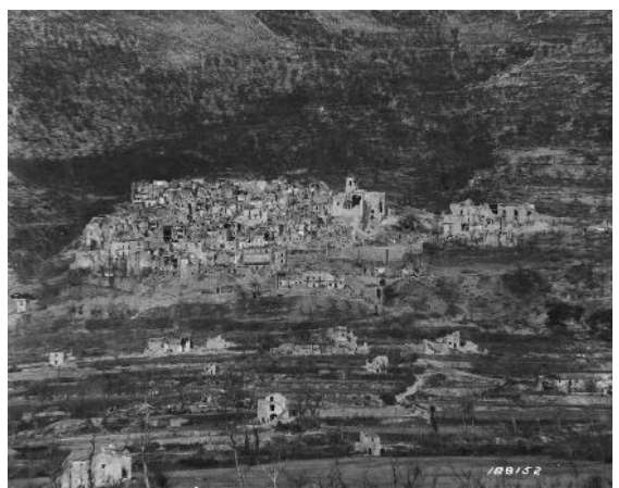
Fig. 09 - San Pietro Infine (CE), reduced to ruins then the Decembrer 1943. The eviscerated church of St. Michele Arcangelo can be seen looming over other buildings in the village (Maslowski 1993).