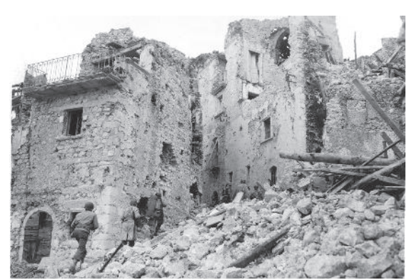
Fig 10 - San Pietro Infine (CE), remains of the village destroyed after December 1943 at the arrival of military doctors (Maslowski 1993)