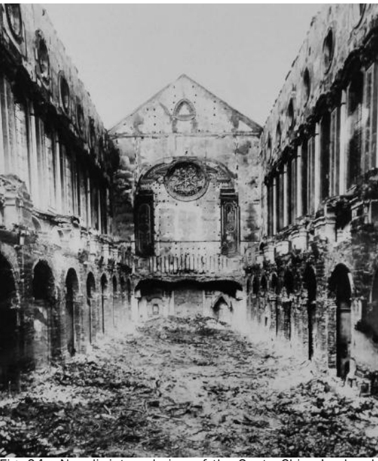
Fig. 04 - Napoli, internal view of the Santa Chiara's church after the Allied bombing of 1943, photographic archive of the Superintendence for Architectural Heritage for Naples and its province (ASBAN).

The Allies behavior was not always exemplary towards the monumental heritage. Overlooking the Montecassino's event and the reasons for its bombing, the story of the Fieramosca castle in Mignano Monte Lungo is significant. In March 1944, the New Zealand troops try to enter in Cassino, but attacks do not give desired results. Therefore, it becomes necessary for propaganda to make a newsreel to be sent in homeland that describes the reasons for the company's failure caused by the German resistance. But the current conditions do not allow filming on the battlefield live. After the fighting, troops are sent to the